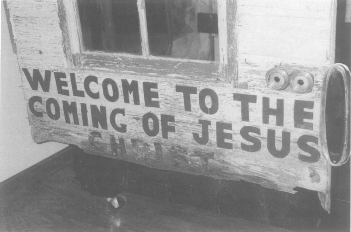
Figure 3. Detail of exterior: vacuumed and repaired.