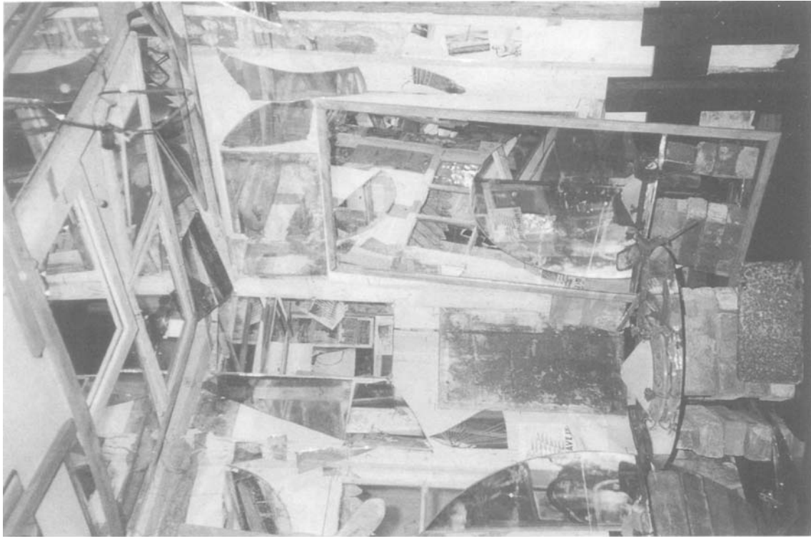
Figure 5. Interior, showing mirrors.