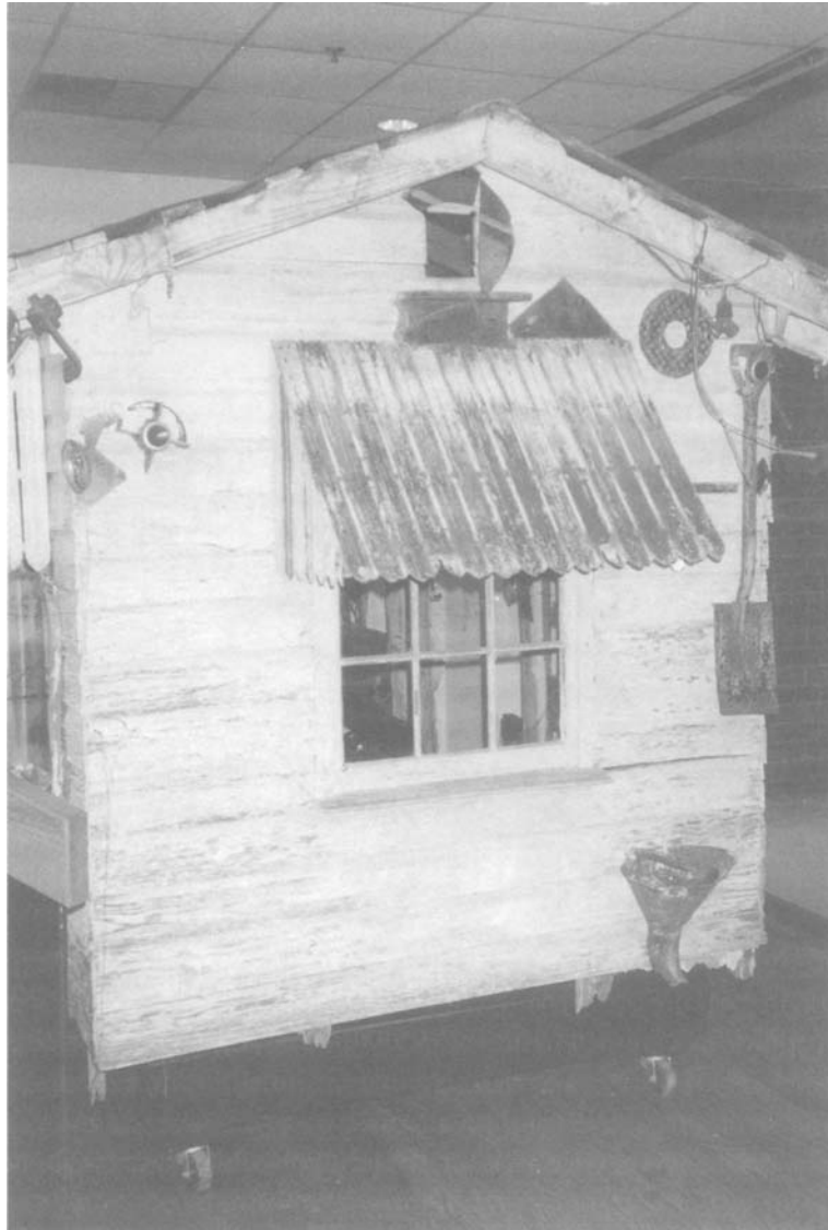
Figure 2. Exterior, showing deterioration of surface.