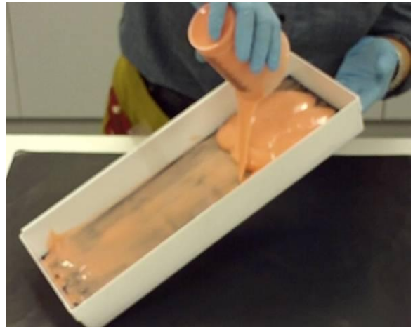
Fig. 2. The remainder of the silicone rubber is poured into the tilted tray.