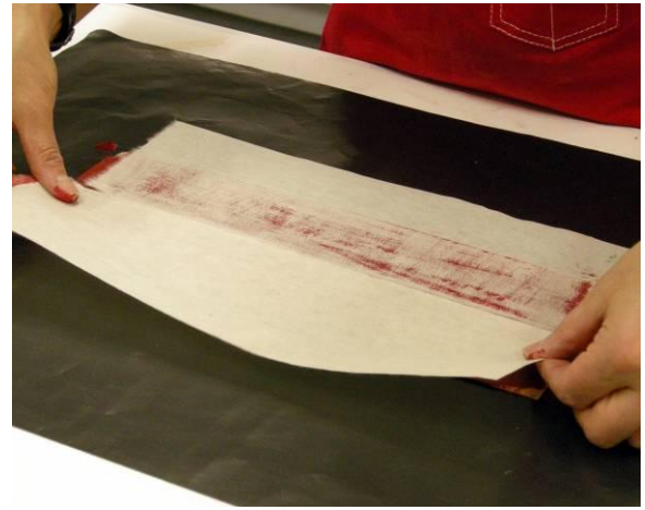
Fig. 5. Japanese paper support substrate is applied to the wet acrylic blend.

The remaining acrylic blend is spread onto the mold with the spatula. At this point in the process there are many options for customization. Further information is presented in the customization section, but the general procedures are presented here. Varying the color and transparency of the layers applied to the mold will produce aesthetically superior repair materials.