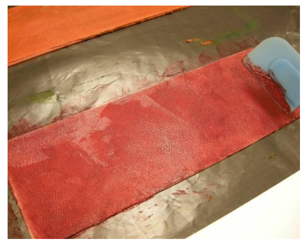
Fig. 4. The acrylic blend is applied to the silicone mold with a wide spatula to create a uniform film.