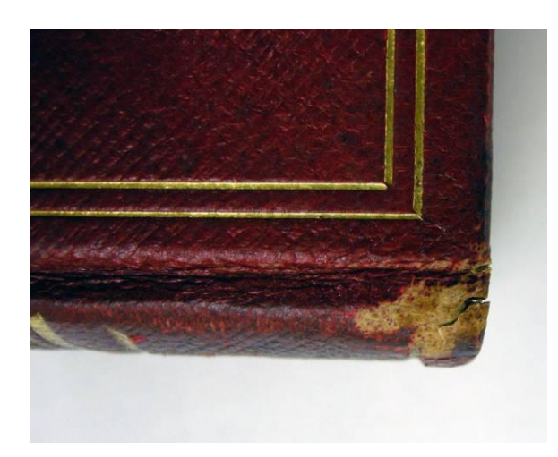
Fig. 6. Sample book, before treatment. Torn and abraded head cap on sample non-collection item.