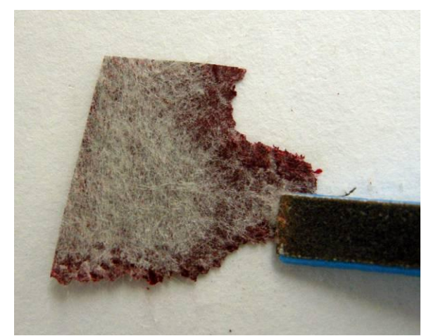
Fig. 8. The verso of a cast composite fill is sanded to expose the cast film along the edge.

Cast composites create less obvious repairs when the support is removed along the edges of the torn repair strip, exposing the cast film (fig.8). Paring and sanding are two of many techniques to create an extended edge and remove visible fibers on an irregularly shaped fill. Pressure sensitive tape can be used to pull away paper fibers along the edges. A damp swab can be used to push and rub away a narrow margin of the paper substrate on the verso of the cast film. Textiles can be cut and threads pulled from the edges to create a shaggy soft edge. Adhesives used to attach the mend to the book will soften the edge of the cast film after application, allowing it to conform and blend into the surrounding texture on adjacent covering material (fig. 9).