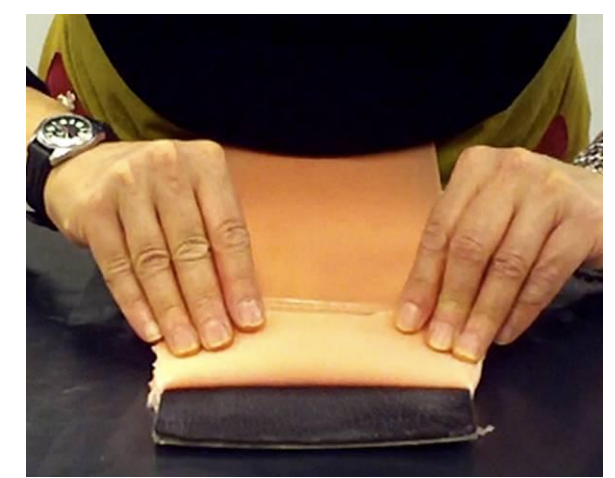
Fig. 3. The silicone mold is peeled away from the leather.

The lifting tabs can be used to pull the panel out of the tray. The silicone mold is peeled away from the leather (fig. 3). It should separate without difficulty. Sticky residues left on the tray can be removed with isopropyl alcohol and paper towels. The cleaned tray and leather panel should be saved and can be reused for additional mold making. The silicone mold can be used immediately and reused many times.